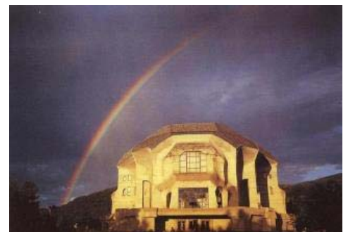
Goetheanum in Dornach, Swizerland, headquarters of the General Anthroposophical Society

You may also write to the Society at: Anthroposophical Society in America 1923 Geddes Ave. Ann Arbor, MI 48104-1797 or call: 734-662-9355