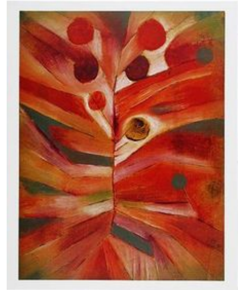
Painting: Paul Klee's "Federpflanze"

www.ccgwb.org / www.thechristiancommunity.org