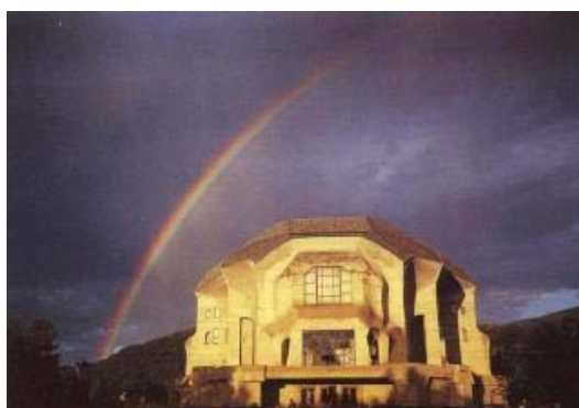
The Goetheanum in Dornach, Switzerland, headquarters of the General Anthroposophical Society

Anthroposophical Society in America 1923 Geddes Ave. Ann Arbor, MI 48104-1797 or call: 734-662-9355