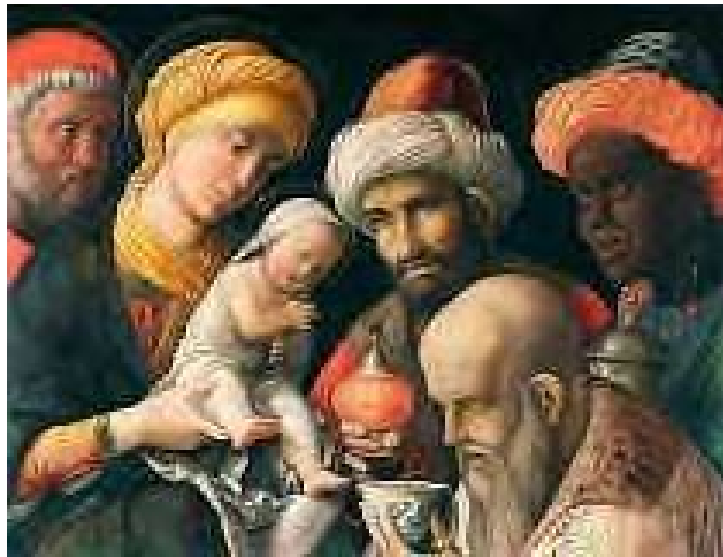
Adoration of the Magi by Andrea Mantegna c. 1500