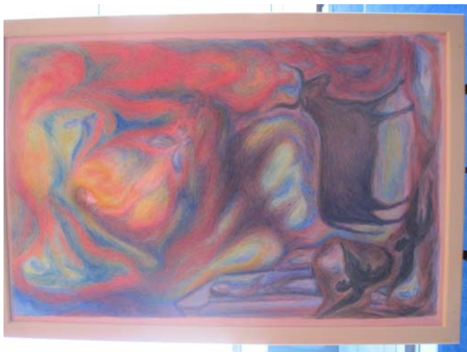
Evolution and some of Wagner’s Ring Cycle .