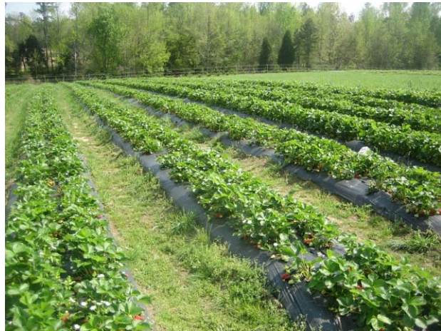
Right - The Strawberry fields at Whitted-Bowers Farm

WHITTED BOWERS FARM Certified Organic and Certified Biodynamic Heirloom Fruit and Specialty Vegetables 8707 Art Road Cedar Grove, NC 27231 919.732.5132 www.whittedbowersfarm.com