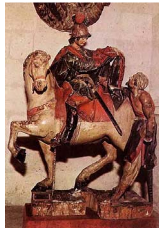
St. Martin and the Beggar